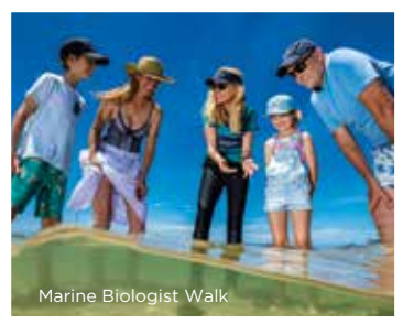
Marine Biologist Walk