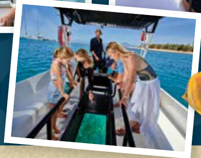
Live entertainment homeward bound.